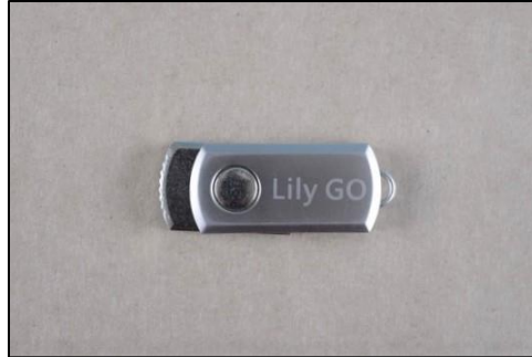
Figure 3. LilyGO USB devices