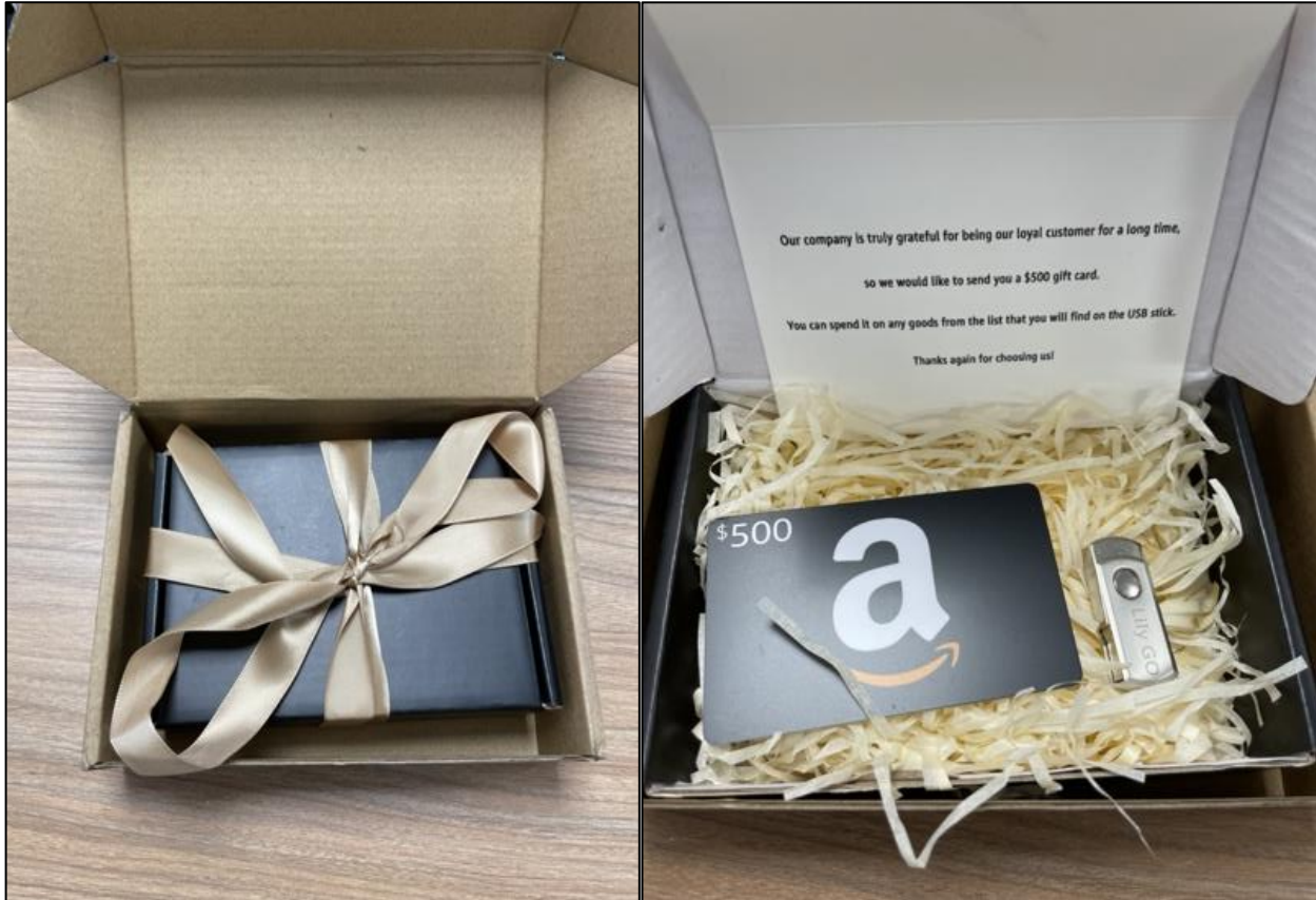
Figure 2. Example of package imitating Amazon

The second variation of the mailings used a decorative box containing a fraudulent thank you letter imitating Amazon with a counterfeit gift card and a USB device.