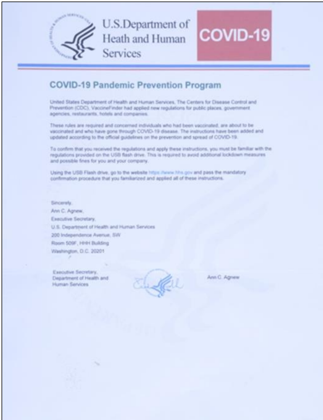
Figure 1. Letter imitating HHS

The first variation of the mailings contained a letter imitating HHS and referencing COVID-19 guidelines, also accompanied by a USB.